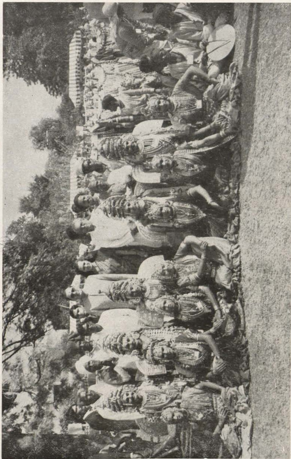
On the occasion of lunch hosted by the Prime Minister to the Artists who took part in the Apna Utsav held in Delhi in November, 1986