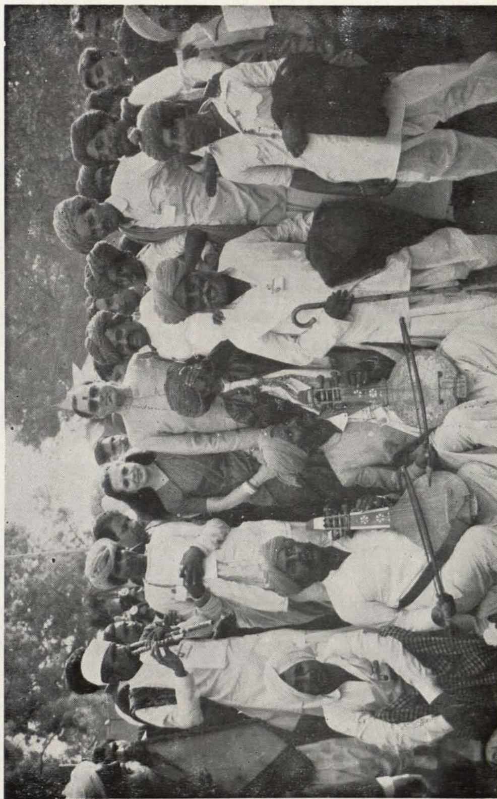
On the occasion of lunch hosted by the Prime Minister to the Artists who took part in the Apna Utsav held in Delhi in November, 1986