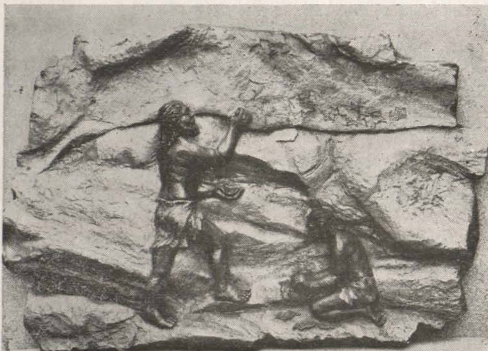
A Fibre-glass Exhibit in 'Yatra' Exhibition showing a Scene of Mesolithic Art Activity