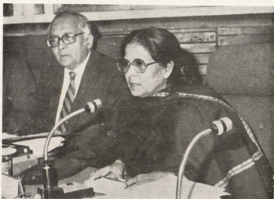
Shrimati Krishna Sahi, Minister of State for Education and Culture addressing meeting of Central Advisory Board of Archaeology