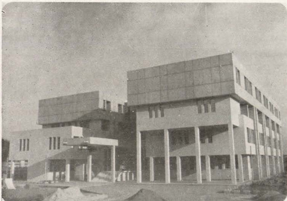
The New Laboratory Building of the National Research Laboratory for Conservation of Cultural Property, Lucknow